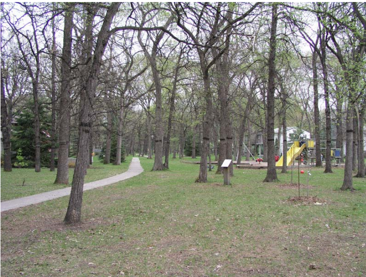
One of three play structures in Wildwood Park