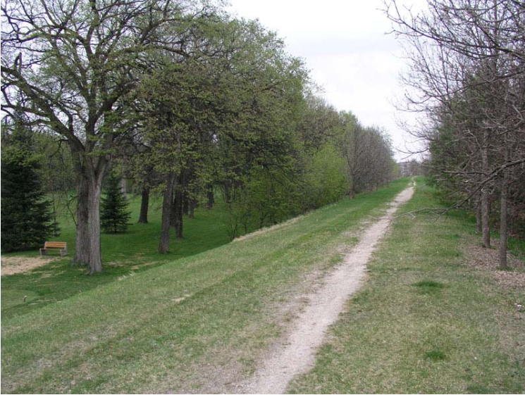
Dike trail between Wildwood Park and Wildwood Golf Course